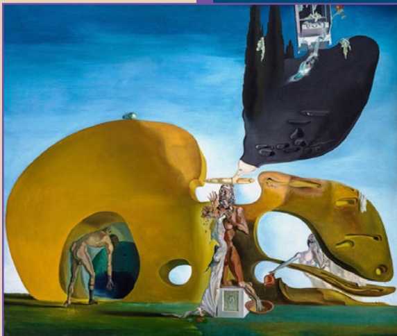
Birth of Liquid Desires (1932)

It was even a rainy day (and a Monday, no less) the morning we left the NH Rio Novo Hotel, umbrella in hand, and strolled the Venice waterways to the Guggenheim, fronting on the famed Grand Canal. As the story goes, Gala sold Birth of Liquid Desires to Peggy Guggenheim personally. It has remained in the collection ever since.