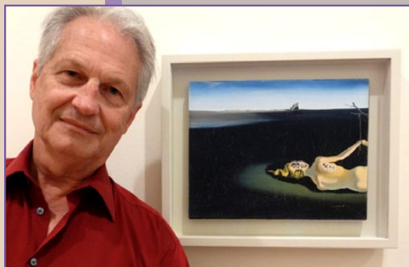
Woman Sleeping in a Landscape (1931)

It is certainly an impressive collection, among Italy's finest, housed at the Palazzo Venier dei Leoni where Peggy Guggenheim lived. It's one of the most visited destinations in Venice. Our visit was during the autumn shoulder season, well past summer peak. But the small exhibit rooms and corridors were none the less gorged with tourists, impatiently filing through. There was little opportunity to simply stand and take in the works at a comfortable viewing distance without feeling pressed in on and rushed by other visitors. Most evinced little grasp or appreciation of the extraordinary art they were hurriedly gawking at.