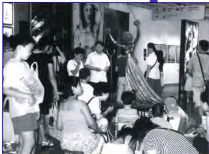
Children at the Dali exhibit in China listen to an explanation of the sculpture Alice in Wonderland and create their own artwork inspired by Dali.

Dali is no stranger to Beijingers. He is widely celebrated for his eccentric, completely unrestrained and provocative works that combine elements of Freudian subconscious imagery with surrealist ideology, and is considered to be one of the greatest artistic geniuses of the 20th century. The last Dali exhibition in Beijing in 2002 at the China National Museum of Fine Arts failed to live up to its hype, and was criticised for being "cold" by the Beijing Youth Daily . Critics lambasted the show's poor organization and lack of information that prevented the audience from understanding the works on display. The display of works was also criticized for being sub-par, consisting of some lesser-known paintings and a small number of illustrations. The critique of the show was particularly scathing given the general scarcity of critical opinion in the local press. But the event did have positive outcomes: the show demonstrated the public's enthusiasm for Dali and generated a great deal of publicity in Beijing about the Spanish surrealist. Therefore the current exhibit has the distinct advantage of following up a show that aroused-but did not satisfy-the curiosity of the local art lovers.