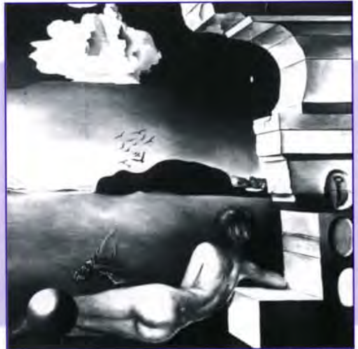
Nu dans la plaine de Rosas

Le Profil de Temps , bronze sculpture with green patina and polished bronze. Signed and numbered "Dali 7/7" on the back right corner of the base. Executed in 1977-1984 in an edition of seven plus three artist's proofs and two hors commerce. Estimated £50,000 - 70,000. Sold for £105,650 at Christie's London. ☺