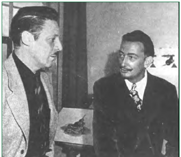
Walt Disney and Dali, 1947

By the 1940s, Dalí was profiting from America's vast popular culture industry, though the country was at war. He designed shop windows and perfume bottles, but he had set his sights on Hollywood. The artist's fascination with capitalism was