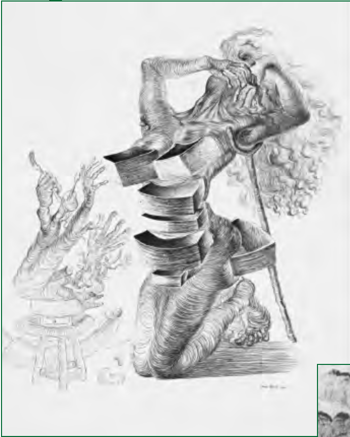
Figure Aux Tiroirs, 1937 (pictured at left) Ink and pencil on paper, signed and dated Estimated: $350,000 - $450,000 Sold for: $478,400 Christie's New York November 5, 2003

Le Triomphe de Nautilus, 1941 (pictured below) Oil on canvas, signed, inscribed and dated "Salvador Dali Gala 1941" Estimated: $150,000 - $200,000 Sold for: $175,500 Christie's New York November 5, 2003