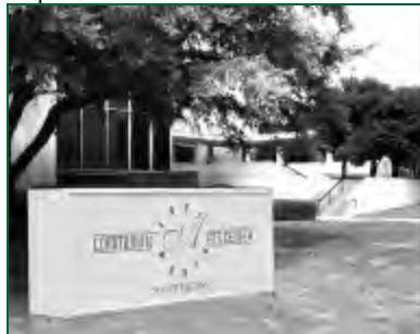
Fort Worth Community Arts Center

Our Dali 100 Years exhibit will then travel south to Texas. The Cultural Center of the Americas has generously offered to host our exhibit in Fort Worth, June 11-27 and will be the recipient of a fund-raising opening night gala on June 10. This black-tie event will be yet another opportunity for Brana clients to mingle with the local elite while previewing the collection.