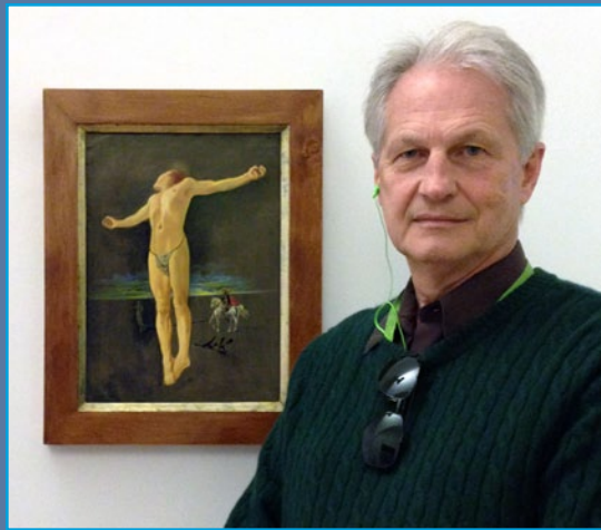
Crocifisso or Christ Crucified - 1954

All web links in this PDF issue are clickable and will open the sites in a browser window.