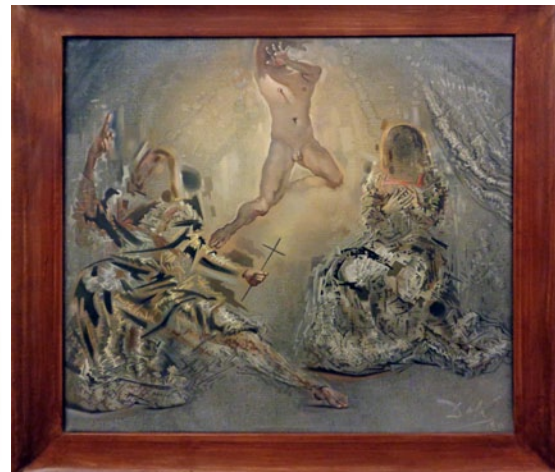
L'Annuncio or The Announcement - 1960

The work we enjoyed most however was L'Annuncio , a 1960 preparatory study for The Ecumenical Council , one of the towering masterpieces displayed at the Salvador Dalí Museum in St. Petersburg, Fla. This study focuses on the upper part of the final work, including iconic references to Michelangelo's The Last Judgment -- the overwrought fresco we'd just seen sprawled across the entire altar wall of the Sistine Chapel.