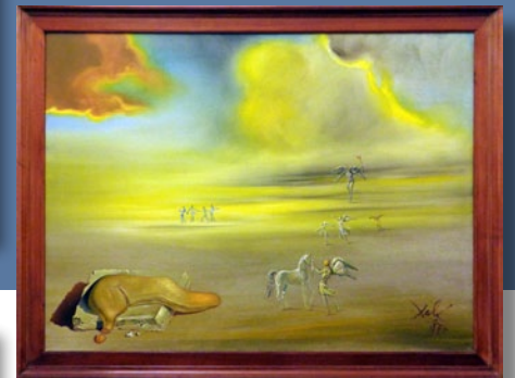
Soft Monster in Angelic Landscape - 1977

Crocifisso was a 1954 study for his Corpus Hypercubicus , a large oil on canvas residing now at the Met in New York. Soft Monster in Angelic Landscape is rife with Dalí symbols of impotence and castration. Oddly, this 1977 work was gifted to the Vatican by King Juan Carlos I in 1980. Is it possible they're clueless as to its meanings?